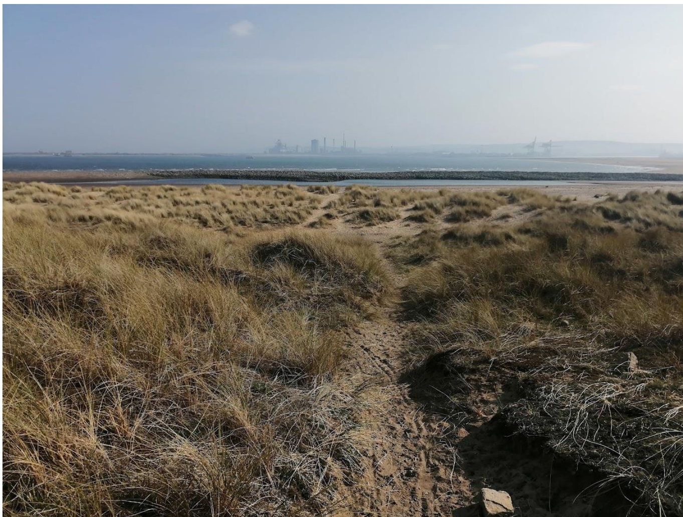
The Hartlepool Coast (North Gare)

Since moving to Hartlepool the difference in landscape has become a new source of inspiration for my practice. The landscapes in and around the area has offered something different stylistically and has affected the way in which I work. From more natural areas of coast to the industrial. This juxtaposition within the landscapes has tested me on conveying the experience of Hartlepool's landscapes.