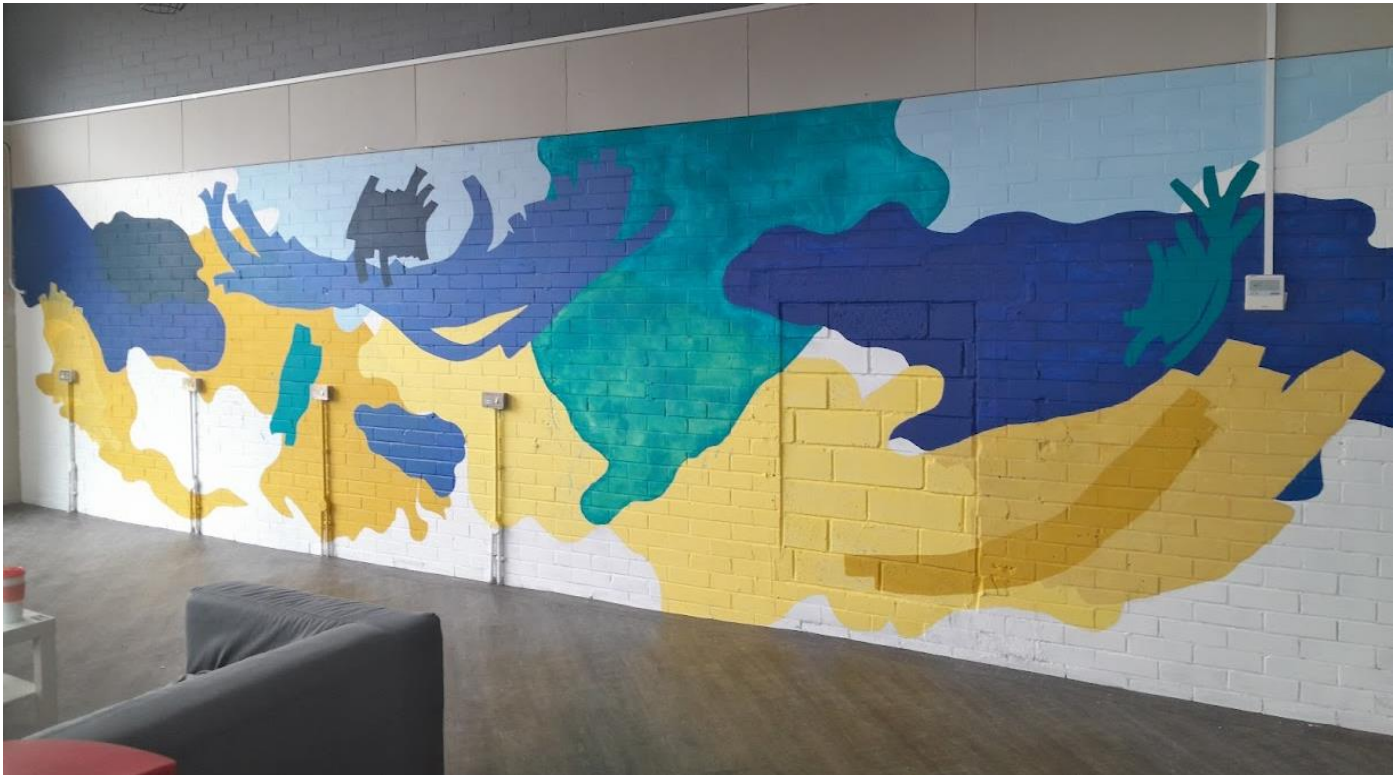
'Shore' Mural in The Northern School of Art's Student Union, 2022

My recently completed mural 'Shore' at the Northern School of Art, presents my view and experience of the landscape in and around Hartlepool. Inspired by the tidal movement along the coastline from Hartlepool and Seaton. Frequently walking along the coastline on the coastline and seawall, allows for different perspectives that were vital for the inspiration that went into this painting. Lines left by the tide on the sand and watching the tidal movement became of interest to me, motivating the creation of this piece. Allowing the viewer to have an impression of standing on the shoreline and seeing waves rolling in.